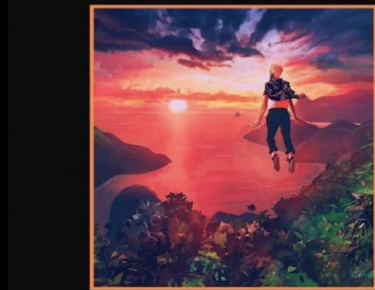
ELHAE - Trouble In Paradise